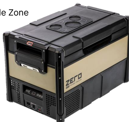
60L Single Zone