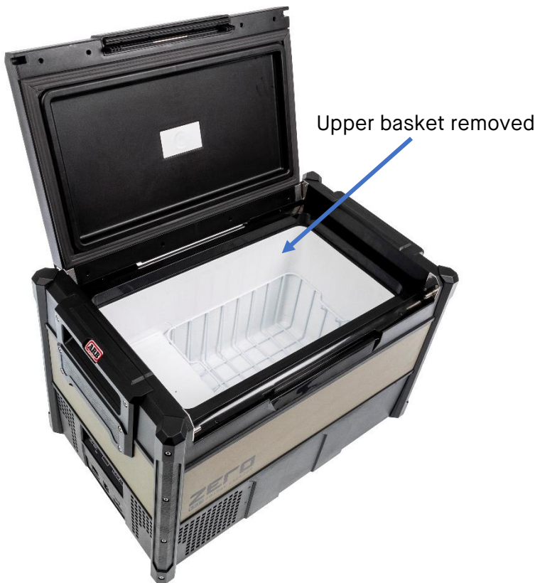
Removable upper basket with built-in folding access door