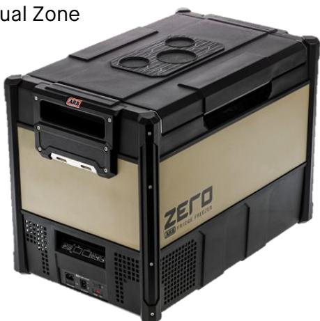
69L Dual Zone